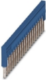
Plug-in bridge, pitch: 3.5 mm, number of positions: 20, color: blue

Please be informed that the data shown in this PDF Document is generated from our Online Catalog. Please find the complete data in the user's documentation. Our General Terms of Use for Downloads are valid ( http://phoenixcontact.com/download )